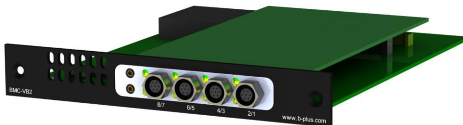
BRICK BMC VB2