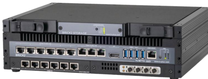
BRICK2 with BMC VB2