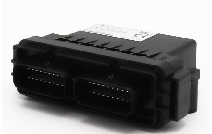
Illustration 1: b-CANCubeMini Sealed Plus

The controller is programmable in C. With a userfriendly API it is easy to start programming.