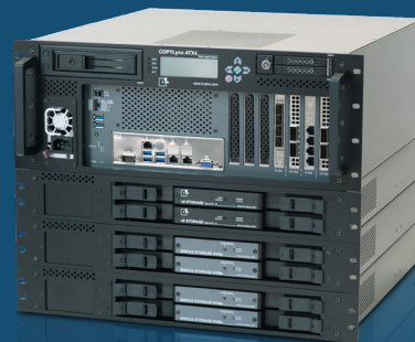
COPYlynx ATX4 Data Copy Station