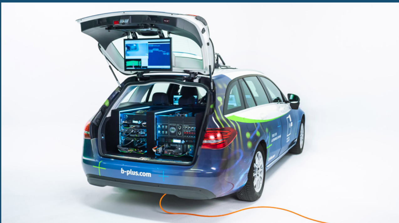
Picture: Demo Car MAX equipped with b-plus Hardware and Software

The DATAlynx ATX4 is the only system in its performance class capable of directly operating on a 12V vehicle power network. Designed specifically for automotive environments, it supports a wide voltage range from 6V to 32V, ensuring reliable operation even under fluctuating power conditions. Unlike conventional systems, the ATX4 is built to withstand voltage drops, spikes, and transient loads, meeting the strict LV124 standard. This makes it resilient to challenges like start-stop cycles and jump-start events, providing uncompromised stability and performance in demanding vehicle applications.