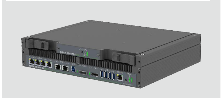
BRICK CORE COMplus with BRICK STORAGEplus