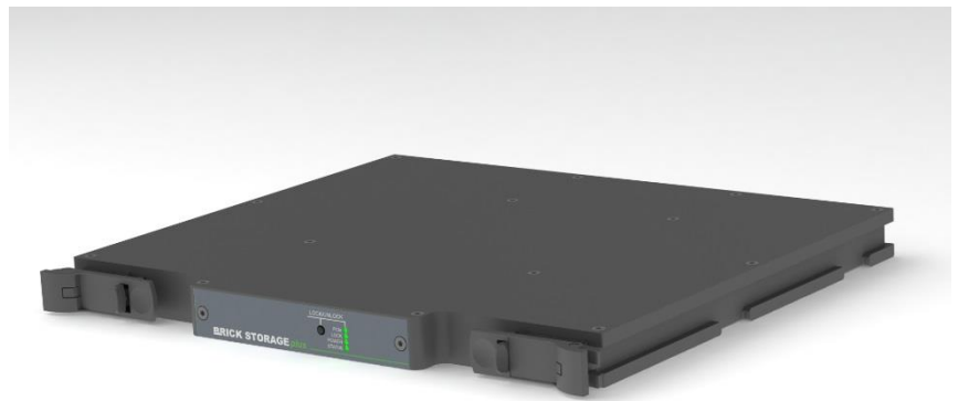
BRICK STORAGE plus