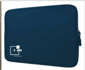
STORAGE Protection Cover