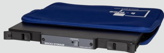
STORAGE Protection Cover (included)