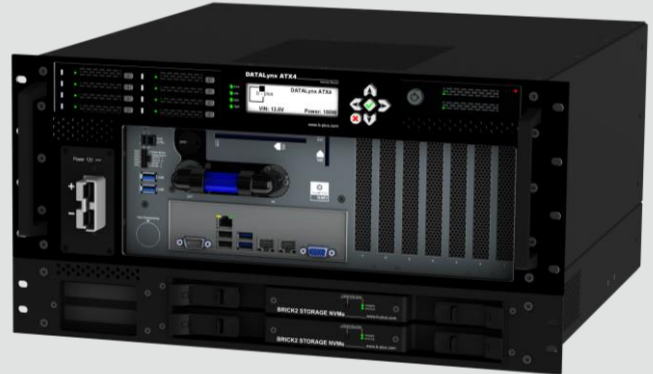
DATAlynx ATX4 with Add-on B2S

typical power consumption 50 W (@writing) powered by BRICK2 or DATAlynx ATX4