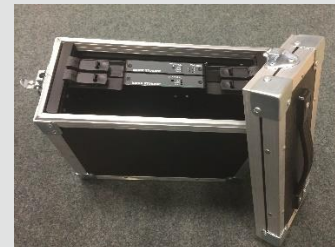
STORAGE Transport case