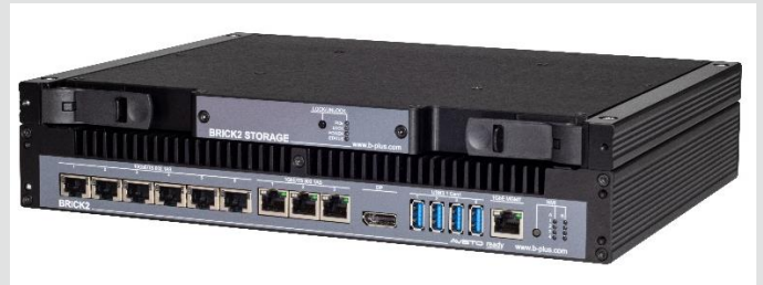
BRICK2 with BRICK2 Storage