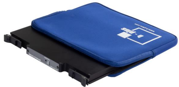
STORAGE Protection Cover (included in the scope of delivery)