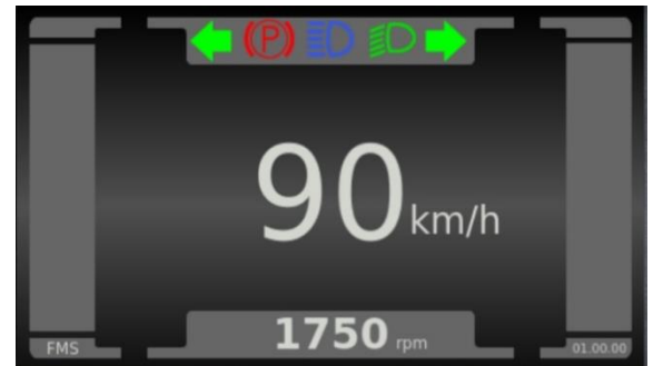
Illustration 1: Display Mainpage