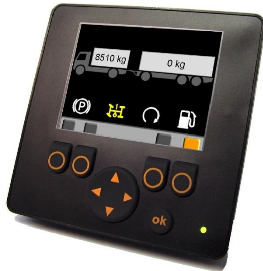
Illustration 1: Data view of the TruckMonitorMini

Due to minimal dimensions (87,5 x 87,5 x 37,7 mm) it is dedicated for mounting as a additional monitoring unit on the body of trucks. If the truck supports this the weight of the truck and the trailer can be shown.