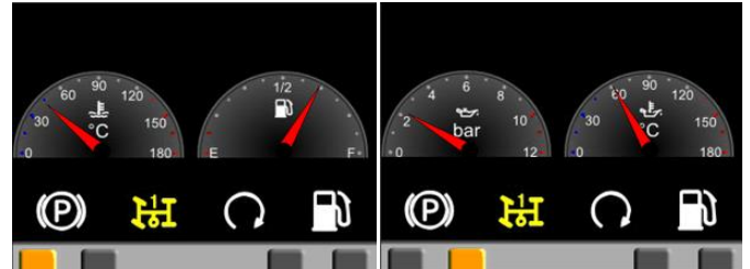
Illustration 2: Page 1 (coolant temperature, fuel level)