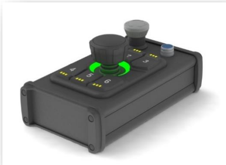
Figure 1: b-ISOBUS AUX-N Joystick

The ISOBUS InCab connector enables a quick, toolless connection within seconds.