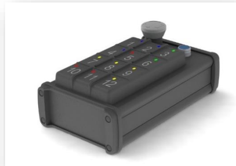
Figure 2: b-ISOBUS AUX-N Keypad